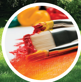
ART p. 11