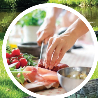
COOKING p. 5