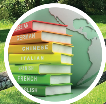
LANGUAGES p. 14

Register online at ChelmsfordCommunityEd.com